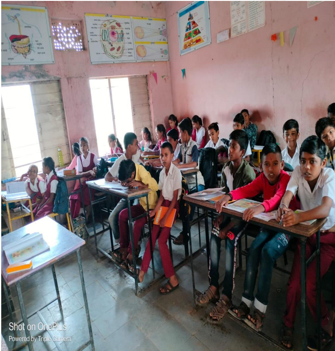
Shot on OnePlus Powered by Triple Camera

Sisri PRINCIPAL New Maulana Azad College of Education (B.Ed.) Pingli Road, Parbhani